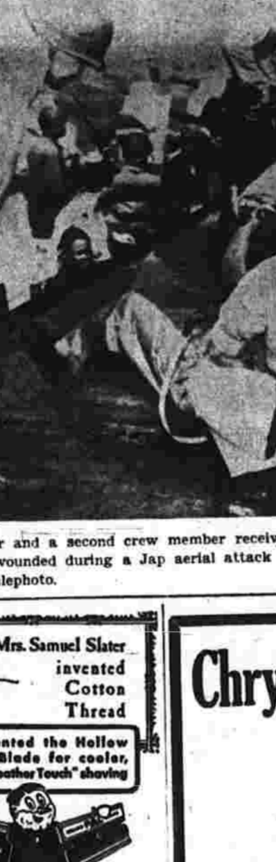
A gunner and a second crew member receive first aid by a hospital corpsman and his shipmates after being wounded during a Jap aerial attack in the Second Battle of the Philippines.