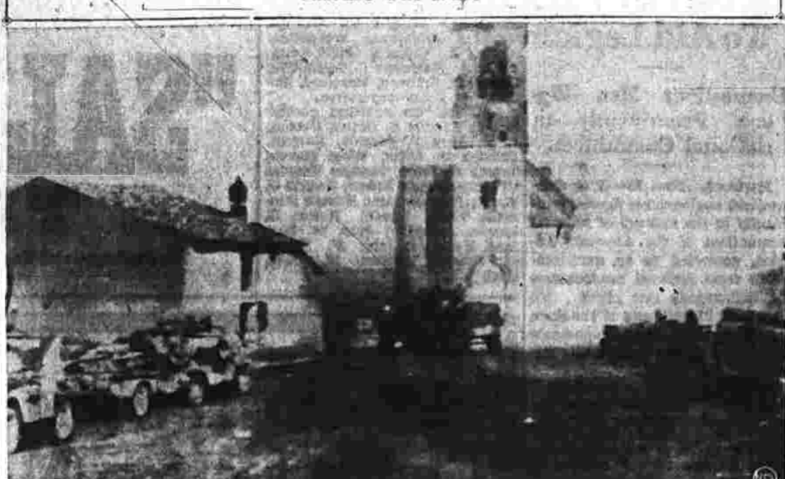
Tank armored vehicles raise clouds of dust as they flash through the village of Beaux, France, captured from the Nazis en route to the fast-moving front. This speedy advance is typical of those made by Axis armies in an all-out offensive on a 400-mile front—Signal Corps Radiotelephoto from NGA.